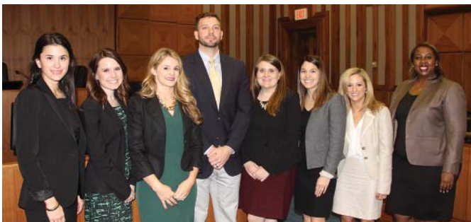
The 2017 Young Lawyers Section Council of the Baton Rouge Bar Association is photographed above after the Bar Leader Installation Ceremony, which was held Jan. 11, 2017, at the United State District Court of the Middle District of Louisiana.